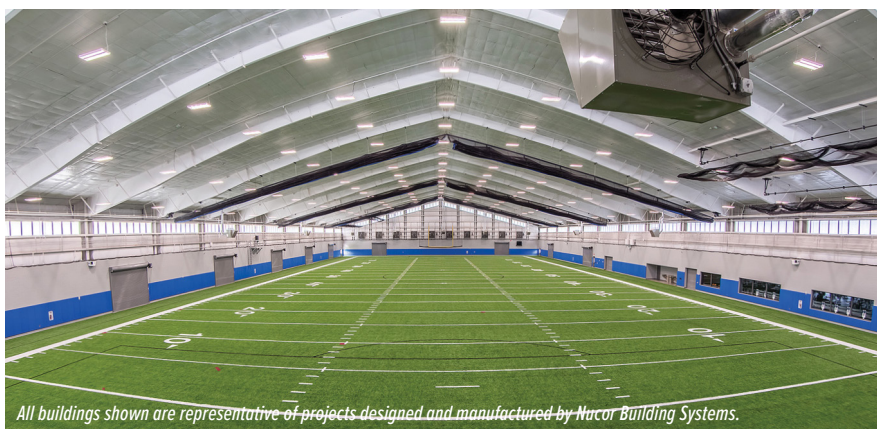
All buildings shown are representative of projects designed and manufactured by Nucor Building Systems.